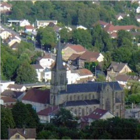
Notre Dame du Bas, constructed 1863 Ronchamp

This basilica was designed by Paul Abadie after winning a public competition. I am intrigued by both the national and religious symbolism in the building. I am interested in exploring the ways in which visitors experience the plazas and take in the views of surrounding cathedrals.