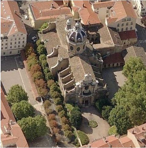
Eglise St-Bruno des Chartreux, constructed 1584 Baroque façade constructed 1871 Lyon

The façade of this monastery is considered to be a masterpiece of Baroque. It consists of three receding levels; a porch bordered with Ionic columns and Doric pilasters, a curvilinear balcony and a niche containing the statue of Saint Bruno. I am interested in studying how the foliage breaks down the scale of the building to the surrounding plaza, creating a more human scale so that the building maintains a presence but is still approachable.