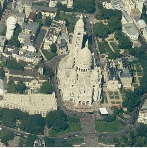
Sacre Coeur, constructed 1875-1914 Paris

This basilica was designed by Paul Abadie after winning a public competition. I am intrigued by both the national and religious symbolism in the building. I am interested in exploring the ways in which visitors experience the plazas and take in the views of surrounding cathedrals.