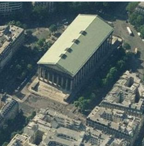
La Madeleine, constructed 1806-1842 Paris

This site, originally designed as an abbey, exists today as a tribute to French heroes. I am enamored with this reinterpretation of the original Roman treasure, and want to note comparisons between them.