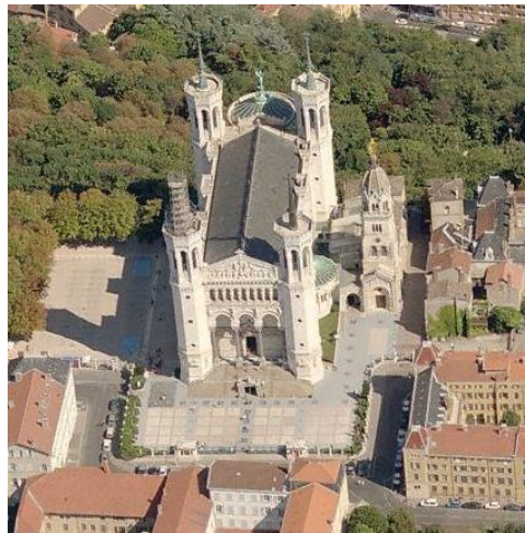
Notre Dame de Fouriere, constructed 1872-1876 Lyon

I was first attracted to this church on a visit to Ronchamp in 2003. The church building is intact and in use, but there are serious signs of lapses in maintenance, most specifically in efflorescence on the walls and the interior columns. It is apparent that most church funding in Ronchamp goes towards Le Corbusier's masterpiece.