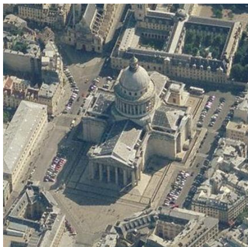
Pantheon, constructed 1758-1789 Paris

Saint Sulpice, the “Cathedral of the Rive Gauche”, is one of the largest churches in Paris. This church has gained recent acclaim in popular culture through novels and film, and I look forward to examining the actual edifice and its stately presence in its neighborhood.