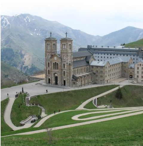
Shrine of Our Lady of La Salette, constructed 1852 La Salette

The façade of this monastery is considered to be a masterpiece of Baroque. It consists of three receding levels; a porch bordered with Ionic columns and Doric pilasters, a curvilinear balcony and a niche containing the statue of Saint Bruno. I am interested in studying how the foliage breaks down the scale of the building to the surrounding plaza, creating a more human scale so that the building maintains a presence but is still approachable.